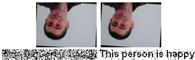
Fig. 2. (left) stego wrongly de-rotated to \theta = -183 and the retrieved data, (right) stego correctly de-rotated to \theta = -184 and the retrieved data.

where \alpha \in \{1, 2, \dots, 359^\circ\} denotes an agreed upon scalar which can form another optional secret key as shown in Fig 2. Note that, for simplicity, \alpha here belongs to the discrete space while in practice is continuous. However, the use of discrete values is encouraged in order to minimise the errors in the recovered bits.