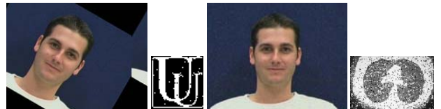
Fig. 1. Resistance to image processing attacks.

To cope with rotation, it is sufficient to locate face features, i.e., eyes, based on the method described in [21]. Salient features form reference points that dictate the orientation of embedding and thus aid recovery from rotational distortions. Fig. 1 (left) shows an attacked stego image with joint attacks of cropping, JPEG compression, translation (offset of 60 pixels) and rotation (-30 degrees) - shown with the extracted secret data and (right) attacked with salt and pepper noise- shown along with extracted secret data.